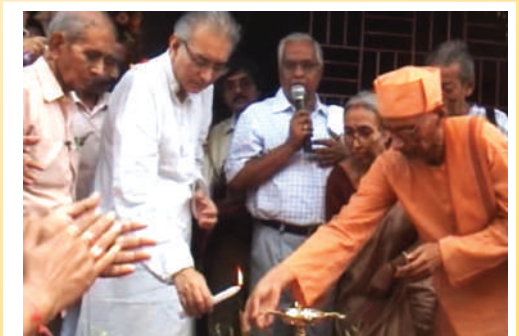
Hon'ble Justice Shyamal Kr. Sen opening the new school building.